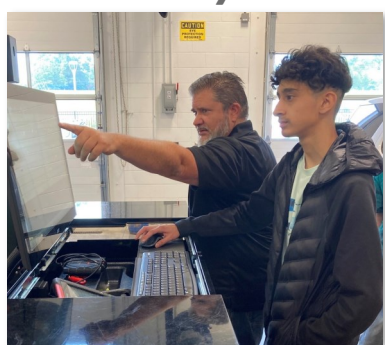
A Pre-ETS student explores career options at Catawba Valley Community College

18 School Systems in 14 Counties: 944 Students Served