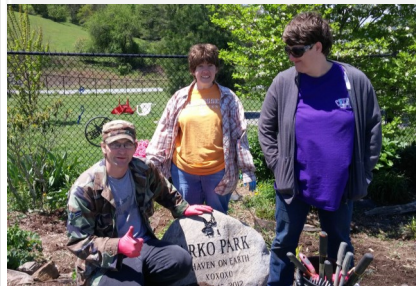
CAET participants volunteer at the Watauga Humane Society Dog Park and Junaluska Park with Adopt a Flower Bed